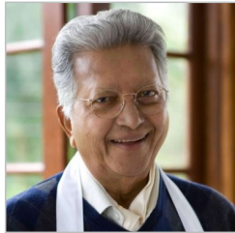
Merrill J. Fernando- Social Responsibility

Merrill J. Fernando is a giant in the Ceylon Tea industry, into which he made a ground breaking entry with his “Dilmah” tea. At the same time, he indulges in works of charity throughout the country which are unmatched by any other commercial organisation. To describe what Merrill does as social responsibility would probably be wrong. Merrill does not do his works of charity as a duty. He truly believes in what he does which is that he should share his good fortune with those who are less fortunate, and it is that which sets him apart as a true human being.