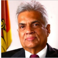
Ranil Wickremesinghe - Prime Minister of Sri Lanka - National Contribution

Hon Ranil Wickremesinghe is a four times Prime Minister. He is the longest serving leader of the United National Party - the largest and oldest political party in Sri Lanka. He has led the party for 24 years. He was first appointed as the Prime Minister on the 7 th of May 1993 and last elected as Prime Minister on 21st August 2015. Wickremesinghe has been a member of Parliament and a Minister since 1977. He has the distinction of becoming the youngest Cabinet Minister in Sri Lanka.