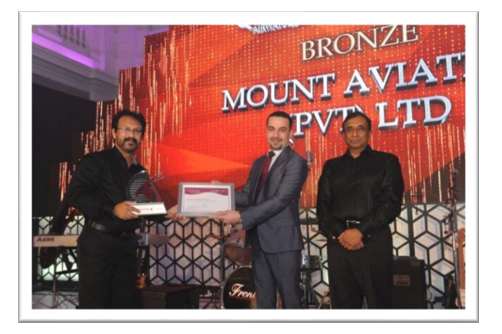
ICC Members Expo Lanka Freight received the accolade for the top freight forwarder and the gold award, with the Bronze award to Mount Aviation (Pvt) Ltd"

Qatar Airways Cargo held its Annual Agents Award event in Colombo Sri Lanka, on 23rd of March 2018 celebrating the region's top freight forwarding agents and their role in supporting the airline's cargo growth. Trophies and certificates were handed out to top 10 freight agents at the gala event attended by more than 200 representatives from the Sri Lankan freight forwarding sector. Qatar Airways cargo and its Sri Lankan General Sales Agent Aitken Spence Cargo recognized all attendees for their support and contribution to the success of the airlines rapid cargo growth in the region.